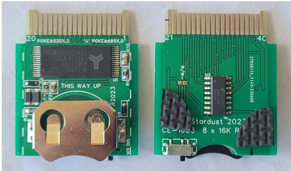
CE1638 Memory Module

The firmware on each bank is stored between addresses &C5-&C104 and is used to switch between banks.